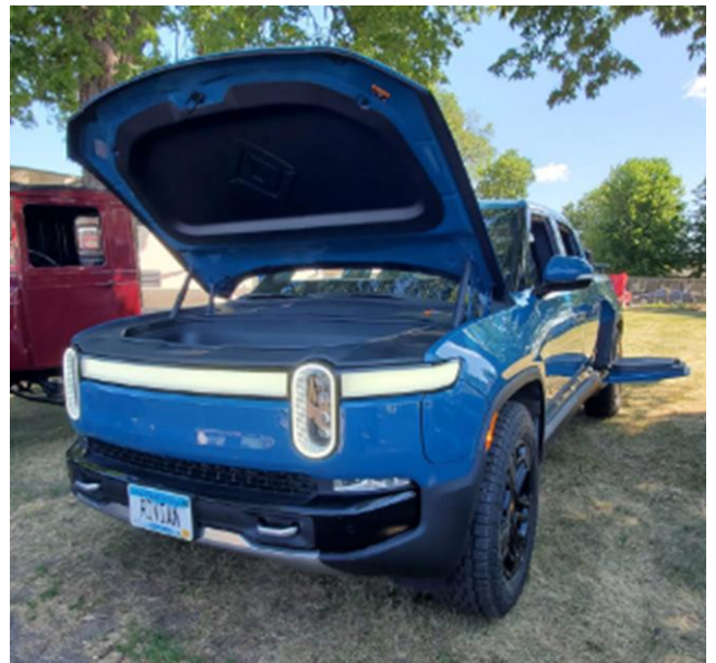
The new Rivian