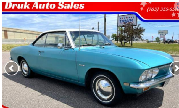
1968 Chevrolet Corvair 500 110 hp/ automatic $6,980 Mileage: 70,772

Corvairs currently for sale at Druk auto sales in Ramsey