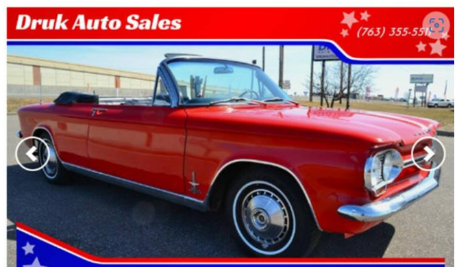
1964 Chevrolet Corvair Monza 110 hp/ 4 spd $13,980 Mileage: 26,676