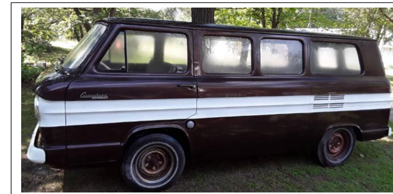
1966 CHEVROLET CORVAIR MONZA

Project in need of finishing . Runs and drives good. Good brakes. Air cooled 6 in rear with automatic transmission . Tires are old but hold air. Good title. Missing mirrors and air cleaners. Solid body. Engine has low miles on rebuild. Doesn't smoke. Kinda rare , only about 8000 built. 10 window , 6 door. Have had for many years, but have lost interest. Needs seat covers. Needs proper battery to fit in compartment .All glass good. Odometer unknown.