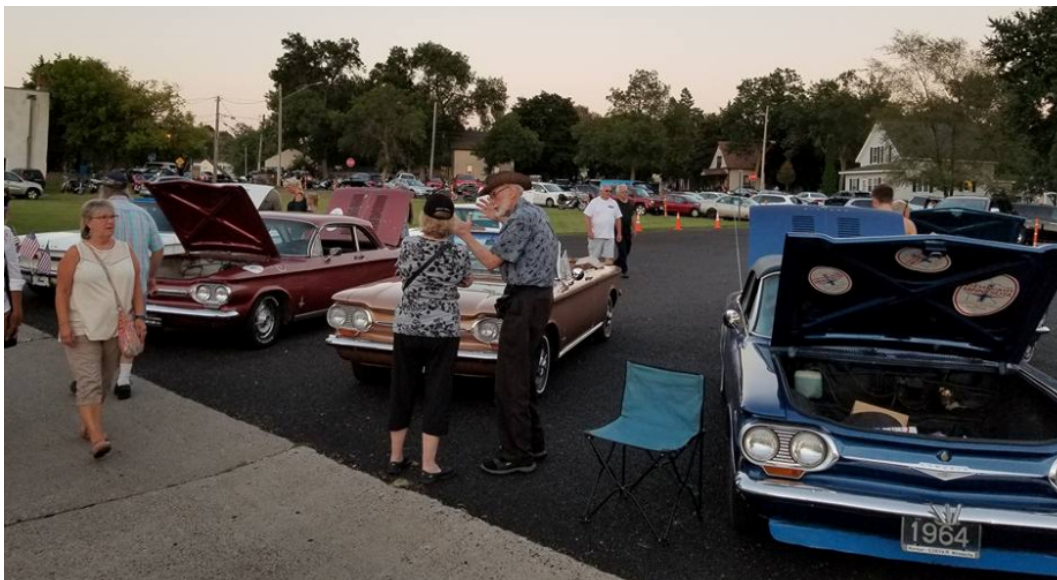
North St. Paul show, July 28th