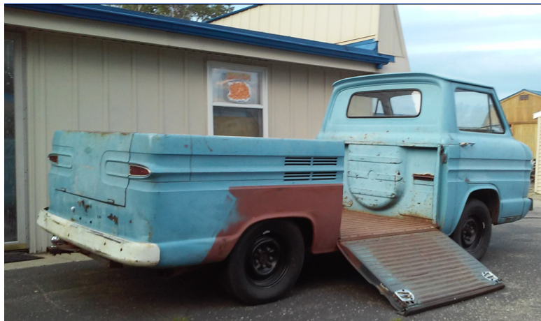
Seen at Barney's Drive In – Waseca on 08/24/2017