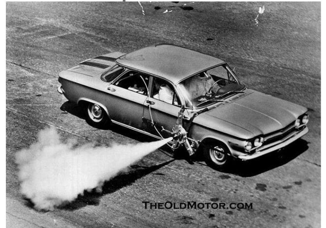
Corvair roll-over test

..... CMI is a non-profit corporation, chartered with The CORVAIR Society of America. Send CORVAIR Minnesota's $20.00 annual dues, payable by Jan 01, to the CMI Treasurer. Membership in CORVAIR Minnesota entitles you to the monthly newsletter, "The Leeky Seal", with free ads for members, a club window sticker, discounts on club activities, information on parts availability, and good advice on the preservation and enjoyment of the CORVAIR automobile.... Yeah!