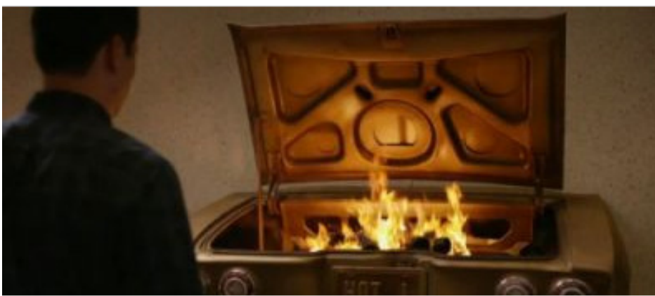
Farmers Insurance TV Commercial, 'Hall of Claims: Red Hot Mascot' "We know a thing or two because we've seen a thing or two"