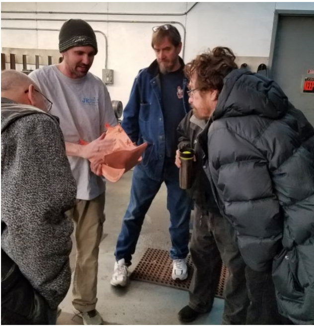
This part was created by additive manufacturing (i.e. 3D printing) prior to coming to JR Plating.

Many steps are involved in a good plating process, but surface preparation is #1. On the previous page you saw the rough sanding and grinding. To properly prepare a part, it must be sand blasted to remove all corrosion (i.e. pitting) which creates voids in the surface. At this point any repair can be done to the part, as well, such as reattaching broken mounting tabs, replacing missing areas, etc. and then the voids can be soldered up and finished smooth. After repair, the parts are copper plated to build up the metal and hide some of the larger flaws on the surface. After inspection, the part may be sanded down and plated again – this process may be repeated many times to prepare a flawless foundation for the final plating.