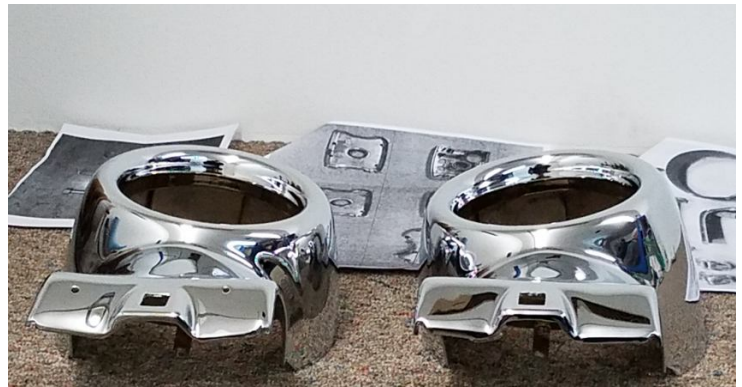
Finished parts – probably better than new!