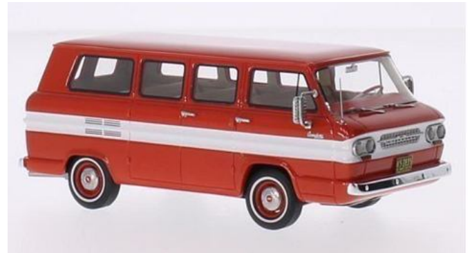
1963 Greenbrier 1/43 scale resin model, recently released by NEO along with Corvaair Van and Rampside.