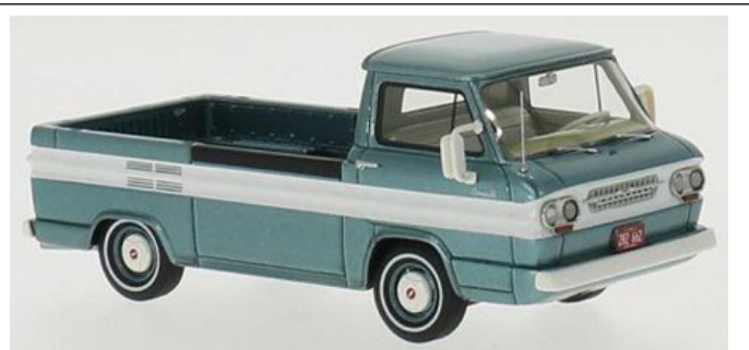
1/43 scale resin model Rampside by NEO