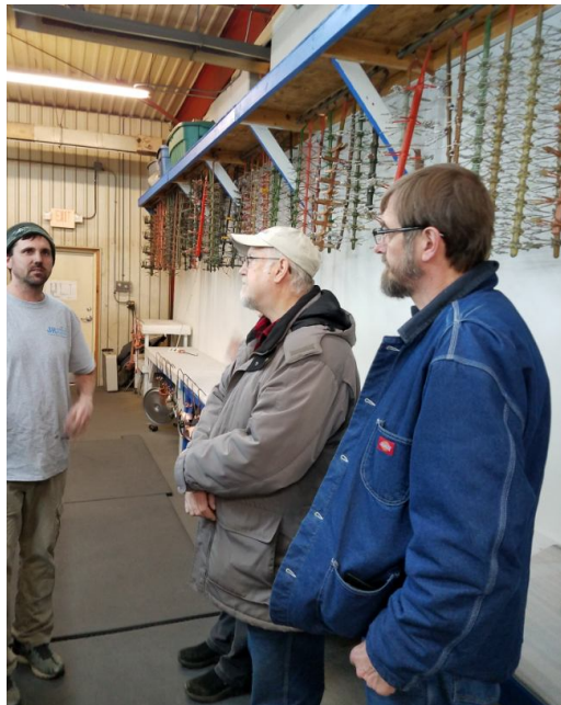
The small fixtures on the wall are used to hold small parts while being plated – metal deposition makes them look like Christmas decorations