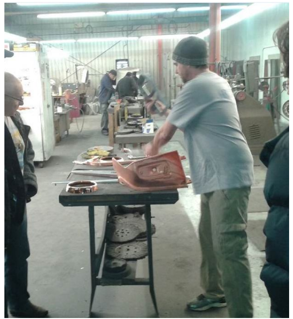
This room has a number of floor mounted grinders, a sand blaster and some work stations for hand work.