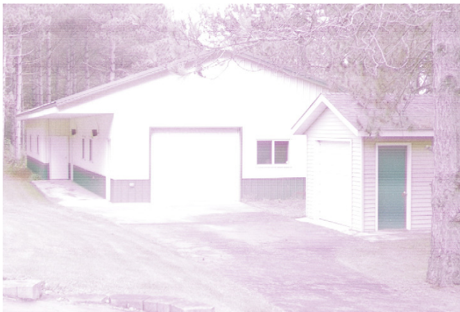
Jim's barn (approx. 34' x 96')