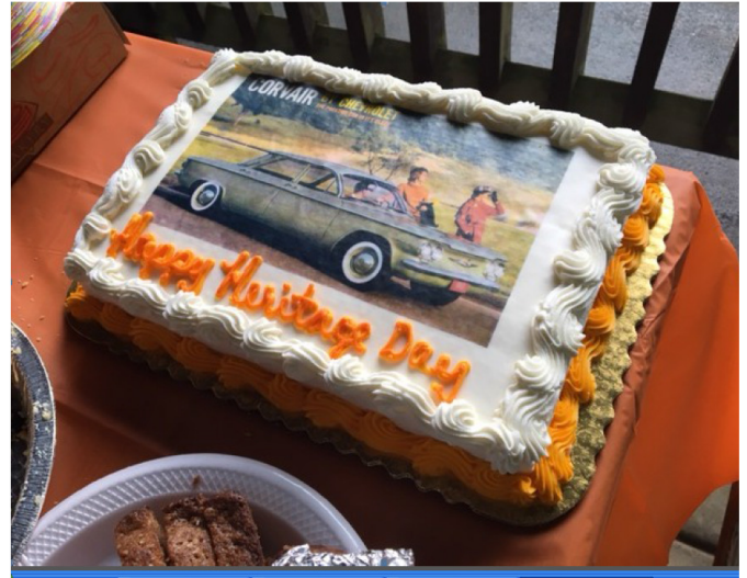
October 2 nd marked the 57 th year since introduction of the Corvair (in 1959)

..... CMI is a non-profit corporation, chartered with The CORVAIR Society of America. Send CORVAIR Minnesota's $20.00 annual dues, payable by Jan 01, to the CMI Treasurer. Membership in CORVAIR Minnesota entitles you to the monthly newsletter, "The Leeky Seel", with free ads for members, a club window sticker, discounts on club activities, information on parts availability, and good advice on the preservation and enjoyment of the CORVAIR automobile.... Yeah!