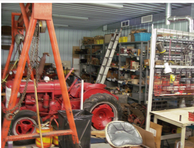
The parts department