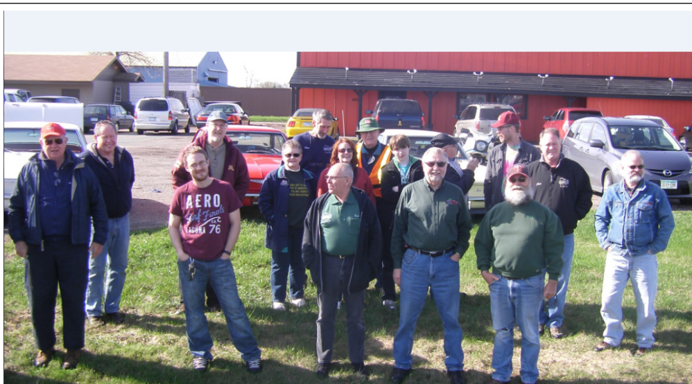
A bunch of CMLers for AAH daze