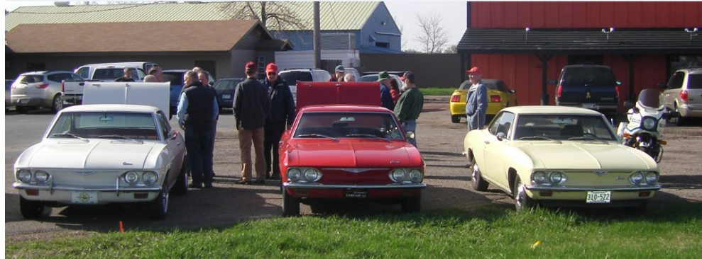
Three Corvairs at Dobo's