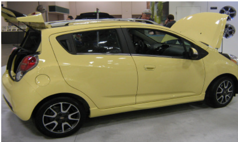
Butternut Yellow LIVES!!!!!! Any similarities to the CMI President's 1969 Monza Coupe are purely coincidental. (Officially Chevrolet calls this color Lemonade)