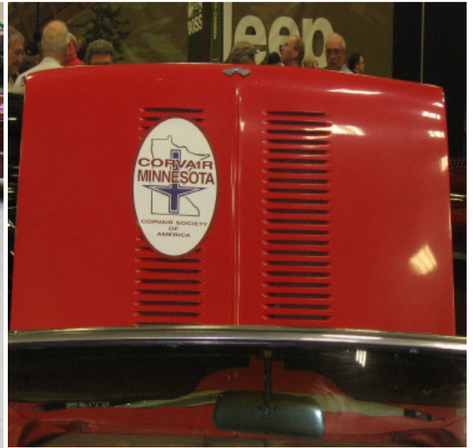
Best Looking Car at the Show! Tom Quinn's '64 at the MSRA's Auto Show Display (he also had his 1950 Plymouth on Display).